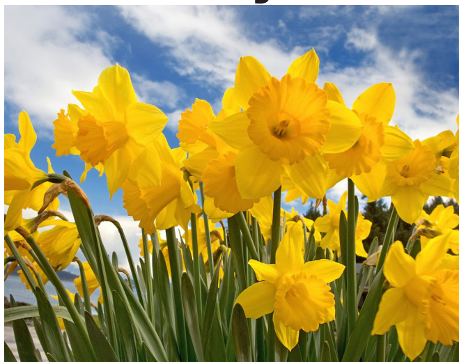
Image: Spring Daffodils

Following on from last edition's announcement regarding the local community web site we are delighted to announce that the web site is now live and up and running.