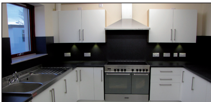
Photographs of the newly refurbished and renovated Kirkhill Community Hall.