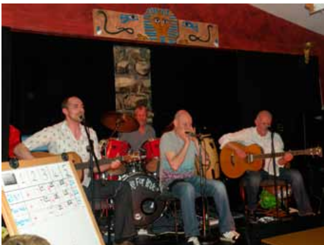
14 Crannog Summer 2011

We are planning another event at the end of June or the first week in July which will be advertised locally nearer the time.